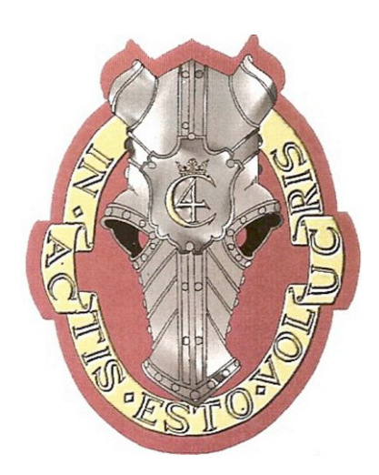
The new regimental badge

But in an effort to make everybody satisfied, it was decided that the"new" regiment had to obtain a new badge.